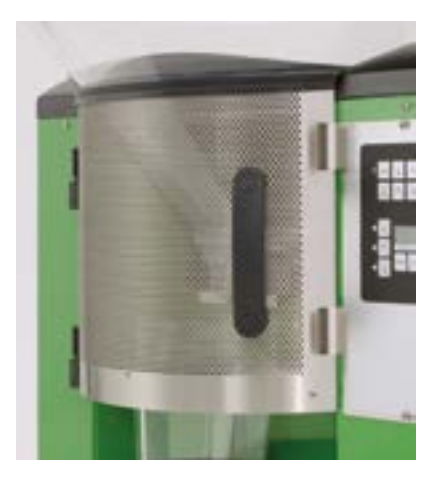
Optional fly protection screen

For older lambs the teat can be transferred to the suction bracket, so that leftover feed can drain off away from the animals.